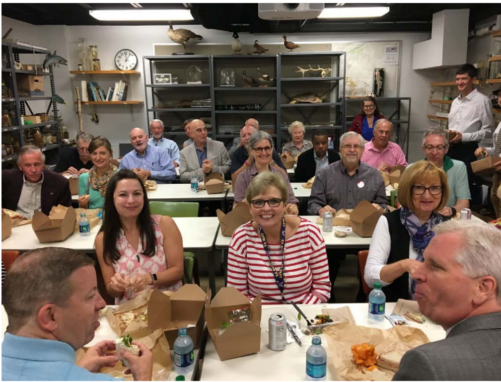
"Club Members enjoying a delicious lunch during our field trip to the UGA Museum of Natural History."