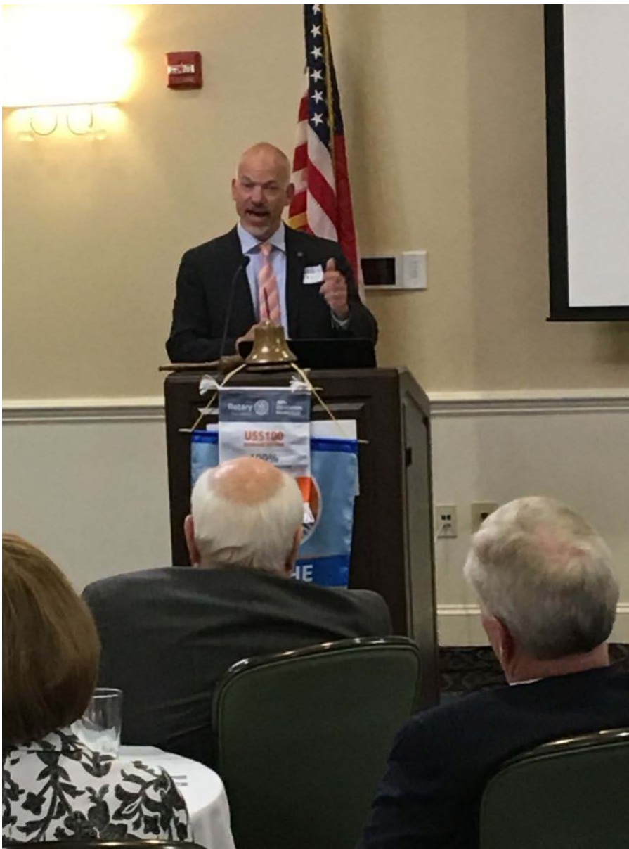
"We were very honored to have had Mayor Kelly Girtz speak to The Classic City Rotary Club of Athens."