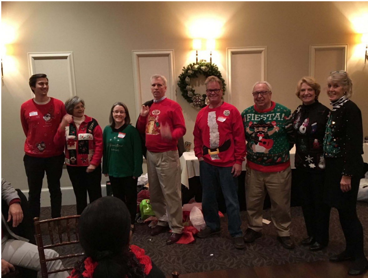
"2018 Rotary Christmas Party Ugly Sweater Contest"