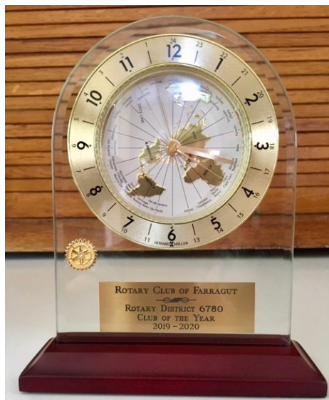
Our award for being Rotary Club of the Year