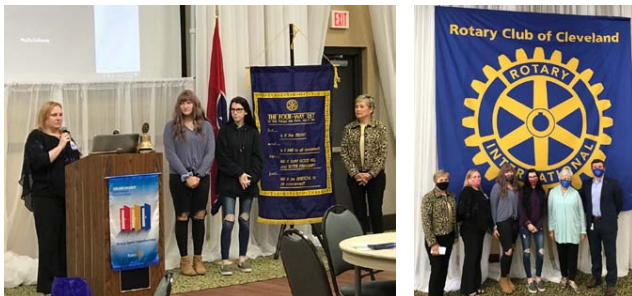
The event was announced at the October 13 meeting by visiting CHS Interact Club Members.

Pre-Registration ends on Dec 1st. After Dec 1st participants will have to register on site. Please be watching for an email with information about the event!