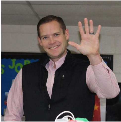
Principal of GOAL Academy