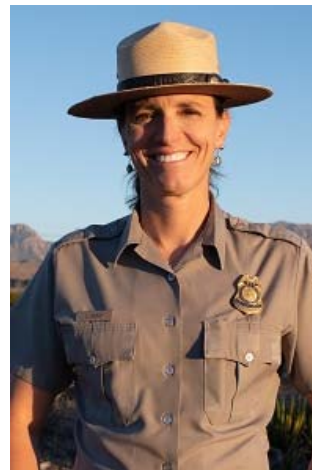
Smoky Mountain National Park Chief Ranger