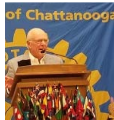
106th Downtown Rotary Club President