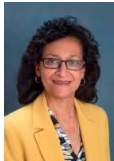
2020-2021 President Downtown Rotary Club