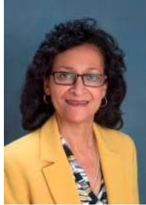
2020-2021 President Downtown Rotary Club