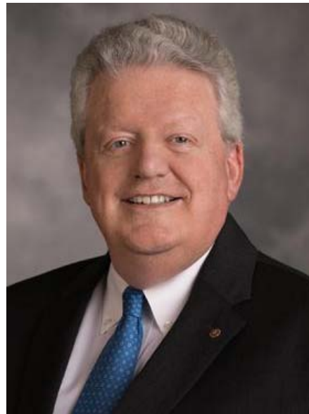
Rotary International President 2019-20