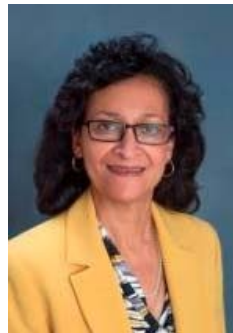
2020-2021 President Downtown Rotary Club