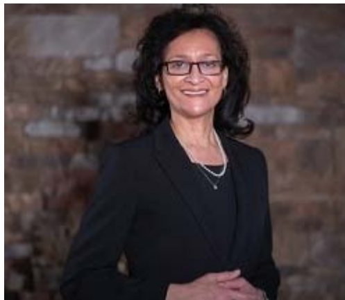
107th President Chattanooga Downtown Rotary