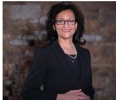
107th President Chattanooga Downtown Rotary Club 2020-2021

Thanksgiving - NO Rotary Meeting November 26th