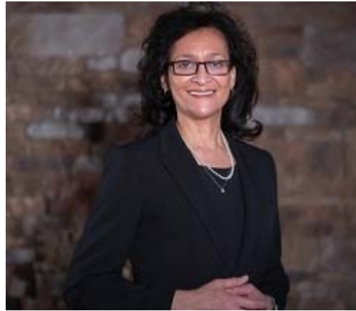
107th President Chattanooga Downtown Rotary