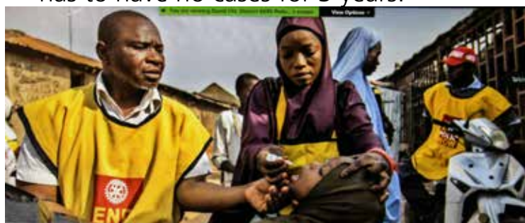
Nigeria and entire African Region Declared Wild Polio Virus Free