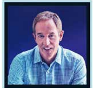
ANDY STANLEY Communicator, Pastor, Author, Better Decisions, Fewer Regrets .