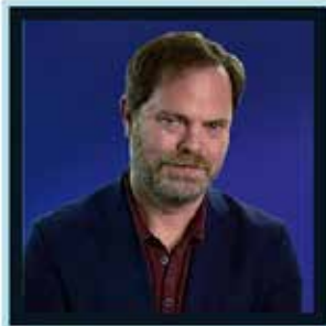
RAINN WILSON Three-time Emmy Nominated Actor ( The Office ), NY Times Bestselling Author.