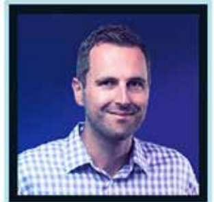
TODD HENRY Founder, Accidental Creative. Author of The Motivation Code .