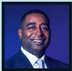
CRIS CARTER Pro Football Hall of Fame Wide Receiver and TV Commentator.