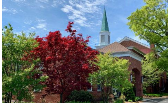
Many thanks to our host, Washington Avenue Christian Church, for their warm welcome during this time!