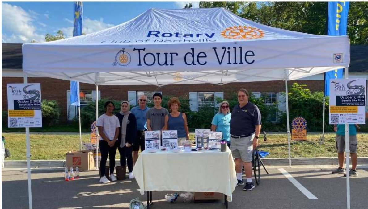
CHANGE across the globe, in our communities, and in ourselves.