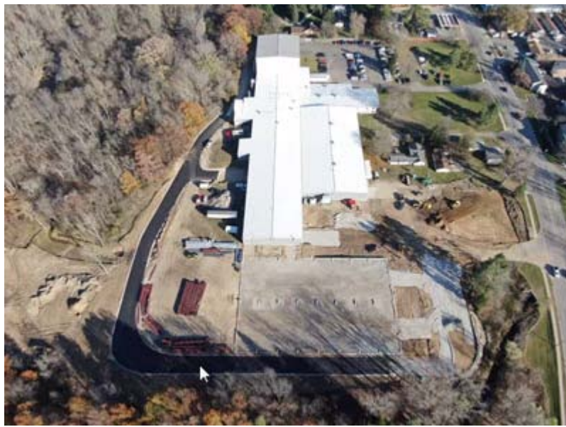
Aerial of site on November 4, 2020