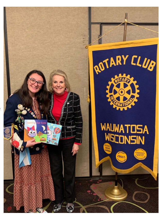
her first book, �Opening Our Eyes, � she created her own publishing company, Lavender

Characterizing herself as �a humanitarian individual who loves to inspire others to enjoy all of the beauty our world has to offer, � she felt compelled to write a children �s book in order to inspire future generations to get out and explore the world. In the process of writing her first book, �Opening Our Eyes, € and Berries Publishing, LLC.