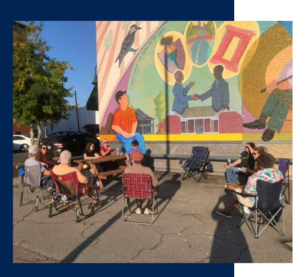
Arkadelphia Sunrise Club meets at Sunset

My vision this year was the continued eradication of Polio as well as the Empowerment of women and children with issues such as sanitation, feminine hygiene, clean water, and waste management. I am continually overwhelmed with gratitude and pride as I visit clubs who have embraced these issues and are meeting needs in their community. Great job!