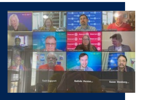
75,000 Zoom hours!