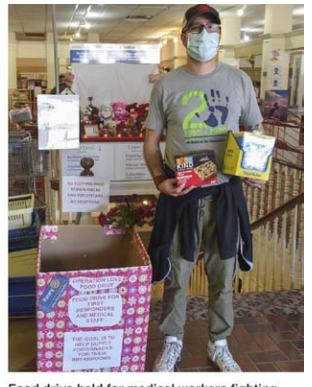
FOOD drive held for medical workers tighting COVID-19 Food and other items are being collected around town as part of a drive to thank the first responders and medical staffs who have spent months fighting

The next project will be "Adopt a Street Program" once it is approved. There is a requirement of at least 6 times a year and preferably one of those