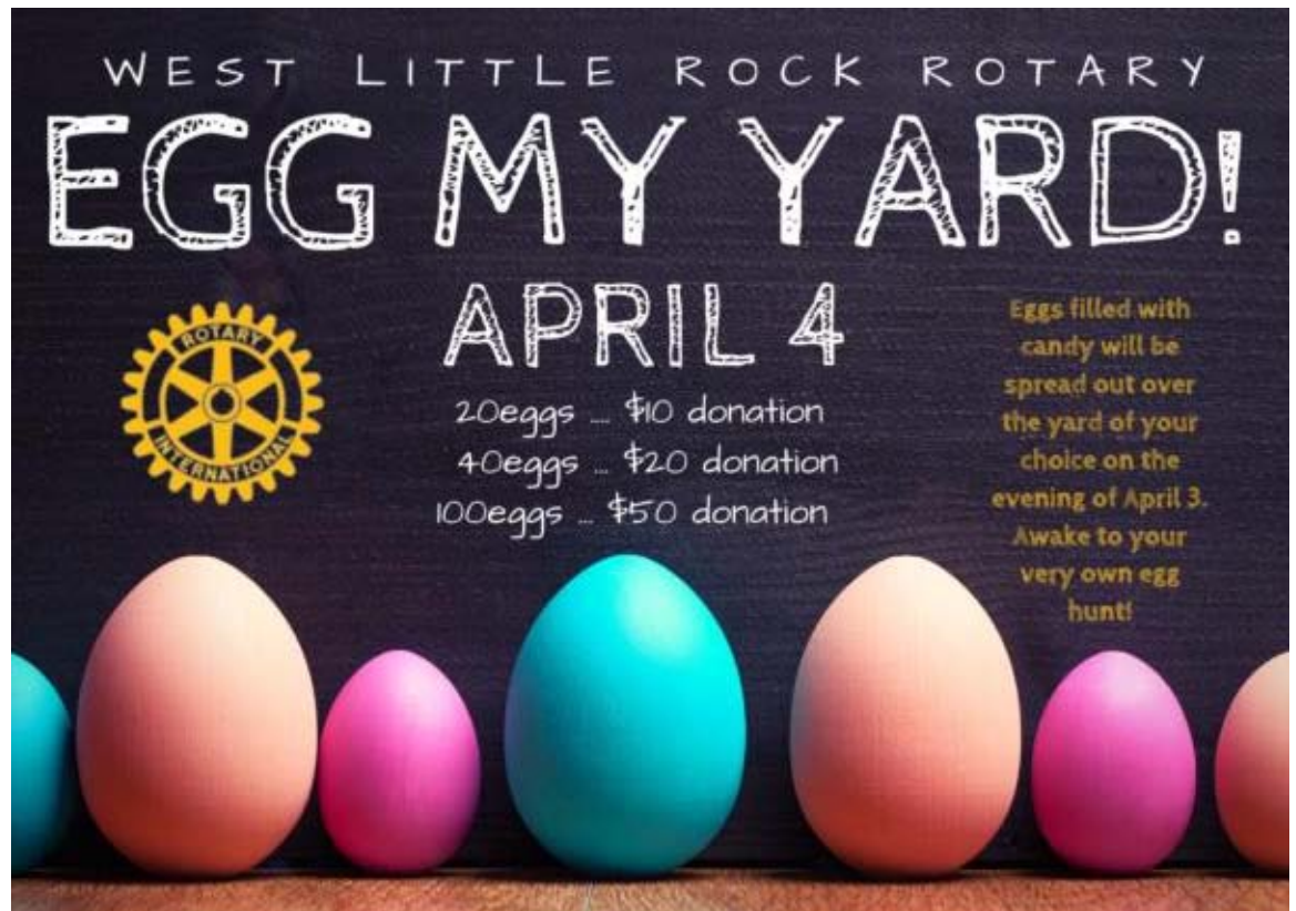
West Little Rock Spring Fundraiser - Egg My Yard

Please help us spread the word around our community for our brand new Spring fundraiser! We will be filling plastic Easter eggs with candy and scattering around the yards the night before Easter so that little ones can wake up to an Easter Egg hunt. Rotarians will be needed to help fill eggs and to deliver and scatter on April 3rd. A sign up will be posted later. For now, please share on social media (posted on WLR Rotary's Facebook page), print and deliver around your neighborhood, share with your co-workers. Delivery is limited to Little Rock, West Little Rock, and North Little Rock. If all goes well, this may be a regular, and fun, fundraiser for our club.