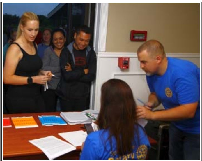
Check-in for runners was at 7:00 am

Some 60 Rotarians volunteer with the elements of the Mud Run this year -- including course prep, securing sponsorships, volunteering on the day of the race, helping with check-in. Those Rotarians put in a total of 485 hours!