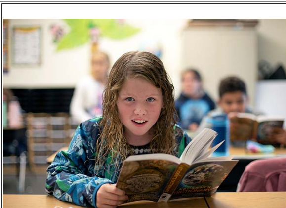
Thomas Jefferson Independent Day School student