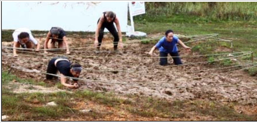
Slogging their way home

at the end of the day... We cleared nearly $45,000 off of this event, and every penny of that will go back into the Club's projects."