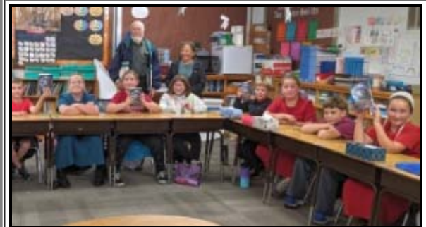
Mazie school kids in Mayes County, OK and their new dictionaries