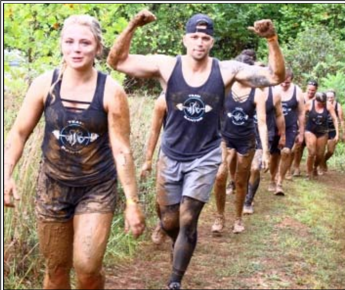
Good clean fun - in the mud!

The course is laid out on the grounds of Ecclesia College, which also provides about 40 students to help on the day of the race (parking cars, manning obstacles, cleaning up, etc.) When the race is finished the club hosts a "Recovery Party" till the pigs come home complete with a DJ and pigging-out on great food (BBQ?) and cold drinks.