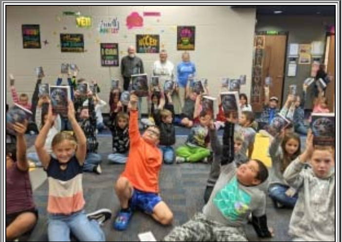
Roosevelt school kids in Mayes County, OK and their new dictionaries

In 1996 a 501(c)(3) nonprofit Association was formed, and The Dictionary Project was born. Since its implementation in 1995, over 31 million children have received dictionaries because thousands of people saw the same need in communities all over the United States.