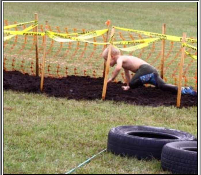
Even the little ones get to have fun!

WHAT'S THIS ALL ABOUT? Most Rotary clubs are looking for ways to cover the cost of the projects they want to do in their community. Finding your club's niche may take some creative thinking...it may even get "messy!"