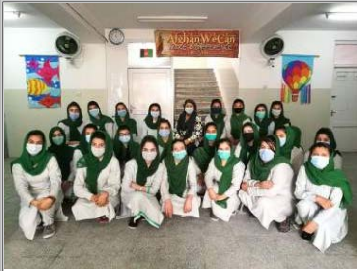
The Senior Group at the School in Deh Subz

This is a story about empowering girls, international service, and Rotary's connecting through relationships!