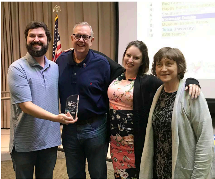
The Southside Rowdies (Rotary Club) lived up to their name and competed well to win the Civic Club category.