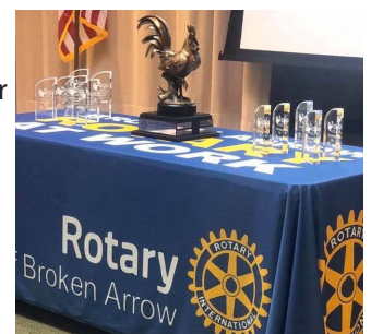
Trophies lined up and ready.

We expect our Happy Hands donation to be at least $2,700