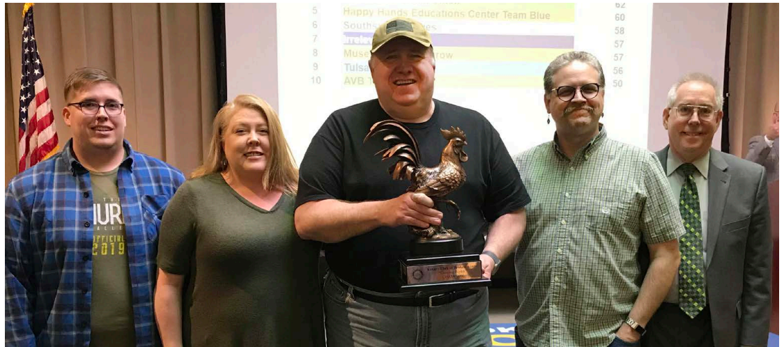
Crowing Rights Champion title belongs to Northeastern State University. They excelled in every round, and are proud to bring "Ollie" home to roost at the Broken Arrow campus until the next contest.

The Trivia contest was completed before any considerations of social distancing had been suggested as public policy. There are many photos here as we celebrate one of our last public events for a while.