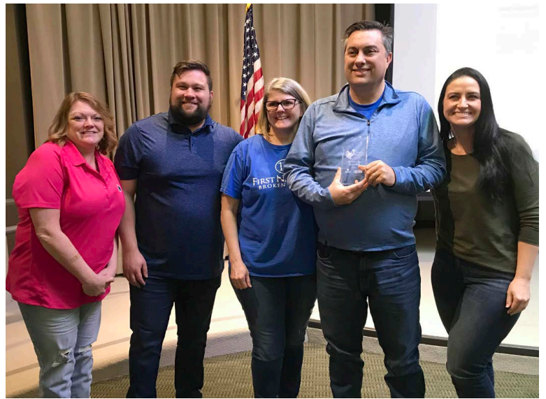
The Business category was won by FIRSThand Knowledge, the First National Bank of BA team. Congratulations!