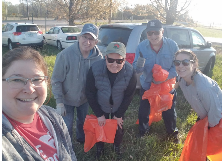
Some of our Club Members helping out with Spring Ditch Clean Up!