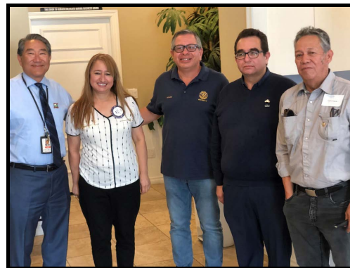
Club Rotario Rosarito Thanks our Club for the Donation of Four City Buses