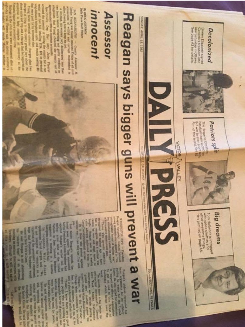
for the purpose of the date.