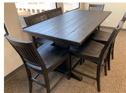
Table: Minh Thanh counter height, solid hardwood, trestle dining table, 4 chairs & bench ($1,200)

If anyone is interested or knows of someone who is interested, please contact Mike Noll at 626.818.5564 (text or voice).