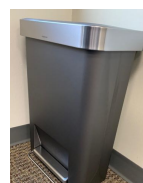
Trash: simplehuman 45L rectangular step can ($50)