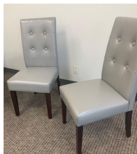
Chairs: 4 - Marshall gray faux leather dining chairs ($300)