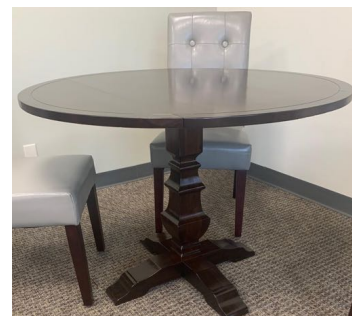
Dropleaf: Bradding 42" diameter, round, drop leaf table - mahogany finish ($175)