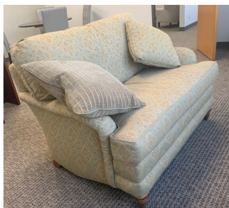
Sofa: Calico Corners custom made loveseat with pillows ($950)