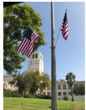
Flags proudly flying on Lake Ave thanks to Altadena Rotarians!