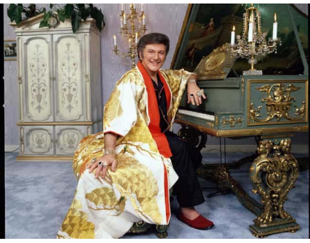
Lberace was the artist who ardoned his piano with gems.