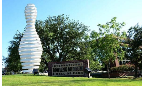
Arlington, Texas - Bowling Hall of Fame