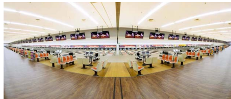
Inazawa - largest alley in the world (Japan)