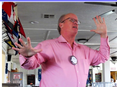
A whole lotta good people in Stockton!

October 30th - Foundation Dinner, Modesto