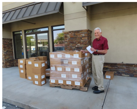
Dictionaries are delivered Tuesday