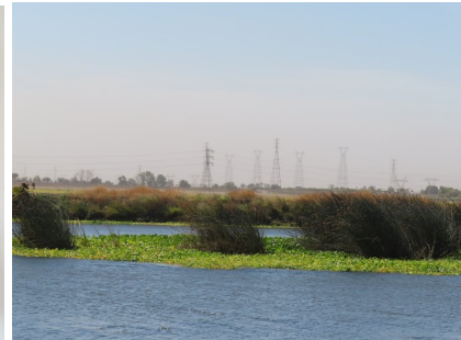
Another million dollar view!