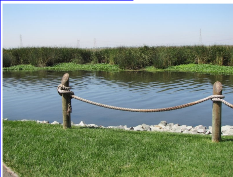
Yes, the view I saw, how serene! The ripples of my life flowing to sea.