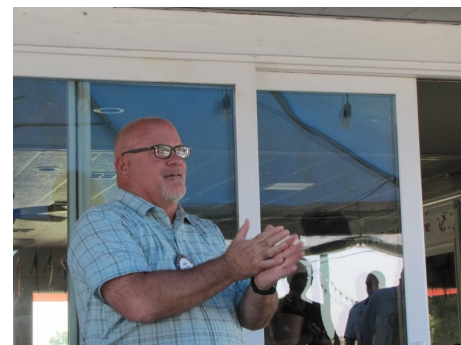
I've got the whole world, in my hands...