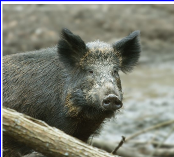
Evan's camping trip visitor!

no power. They decide it's late enough and all retire for the evening, figuring the power will be on by the morning. Then they hear rustling and figure it's one of the children, but it's not. It's five wild pigs raiding their cooler! So sad because you know those middle pigs will grow up very unadjusted. Anyway, they ate the good stuff, milk, cheese, pudding making it a very dairy free weekend.