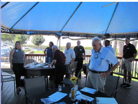
Standing in the cone of silence.