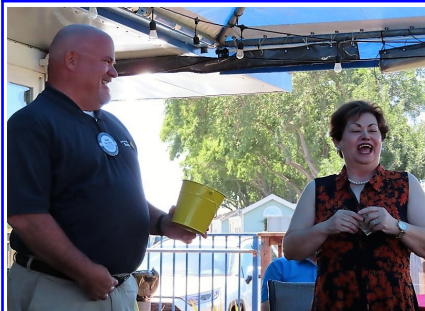
Happy Grandma fills the bucket!