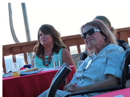
Pals hangin' at their Rotary meeting!