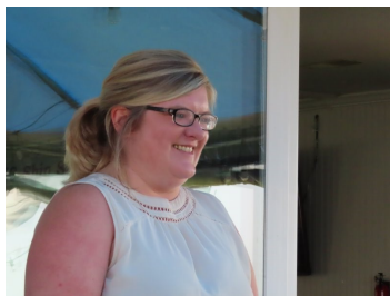
Kendra introduces our speaker.

Lorie Liddicoat reported the Food Bank needs volunteers to work. Fridays at 8:30 to 10:30. please wear masks. Also the American red Cross needs blood! September Blood Drive. So September 21 NSR gives blood, please sign up. Please bring a $10 gift card to create a raffle prize to donors.