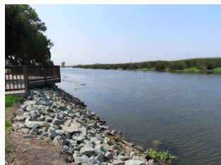
1500 miles of Delta!