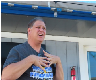
Old Jim, our pets are so dear.