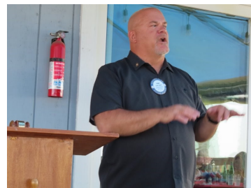
Ode to my Dad, very nice.