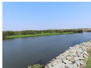
Where's your ski boat?