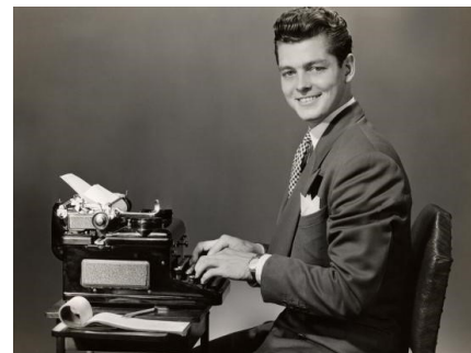
The NSR Secretary position is still open.