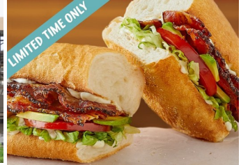
BLT's for Lunch!

Sometimes I just want it to stop. Talk of Covid, protests, looting, brutality. I lose my way. Become convinced that this "new normal" is real life.