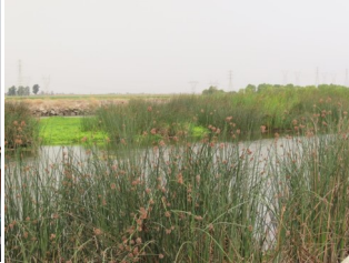
as you drive into the