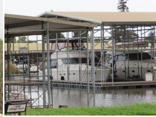
Village West Yacht Club.