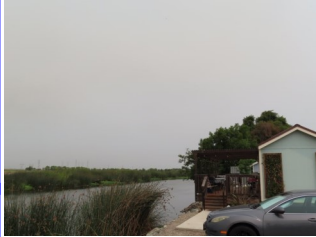
Smoky Day Delta views