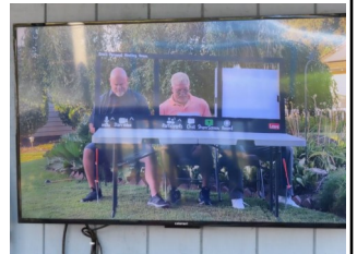
Kickout spooof on zoom meetings