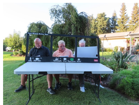
The boys, pulling off a great skit.