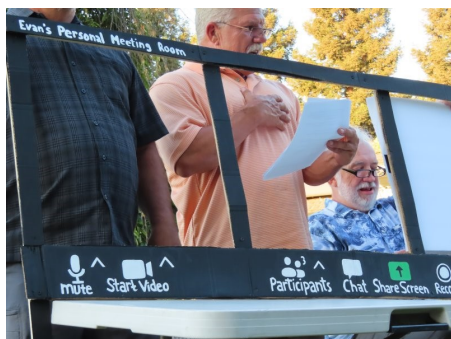
Pledging with stomachs at eye level