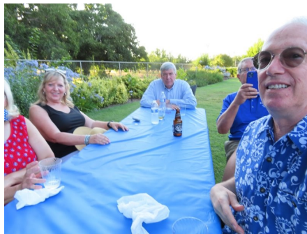
Beautiful evening, funny show and great food and fellowship.