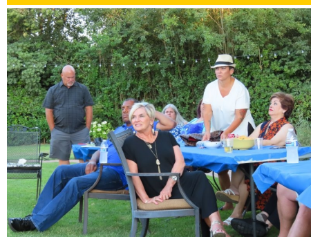
Getting ready for the punchline.