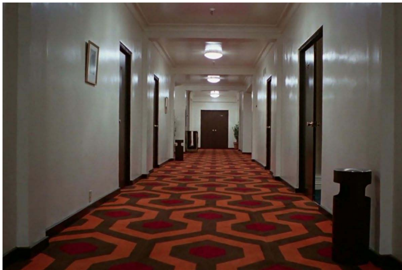
This week's zoom background!