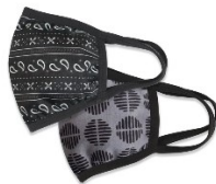
Printed Fabric Face Mask