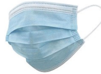
Disposable face mask