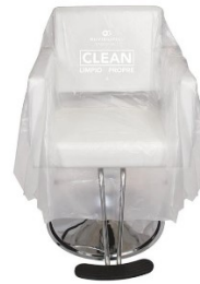
Disposable Chair Cover