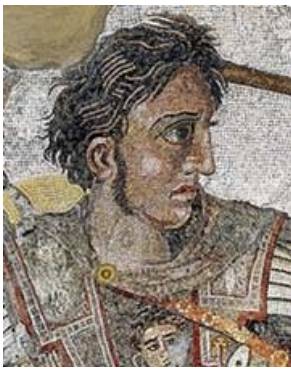
331 BC Alexander the Great defeats Darius III of Persia in the Battle of Gaugamela