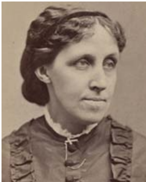
1868 "Little Women" by Louisa May Alcott is published in America by Roberts Brothers of Boston