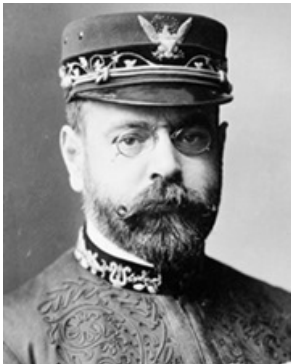
1880 John Philip Sousa becomes new director of US Marine Corps Band