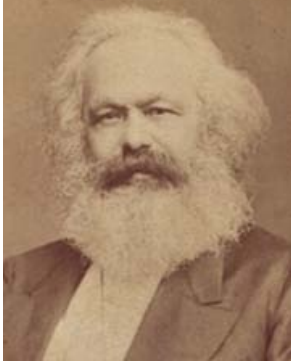
1867 Karl Marx' "Das Kapital" published