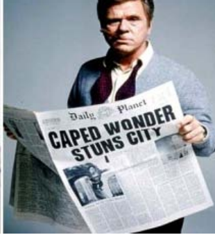
1922 Jackie Cooper , American actor and director (Skippy, Superman), born in Los Angeles, California (d. 2011)