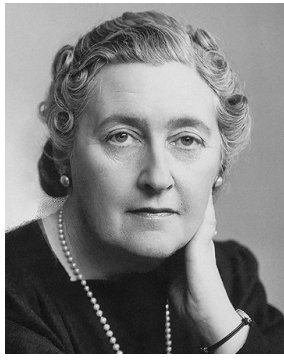
1890 Agatha Christie , English crime writer (Murder on the Orient Express), born in Torquay, Devon (d. 1976)