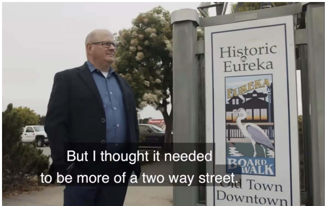
But I thought it needed to be more of a two way street.