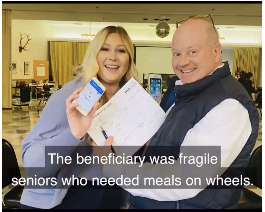
The beneficiary was fragile seniors who needed meals on wheels.