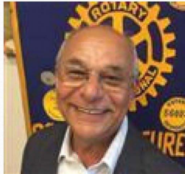
Ken Singleton 2019/2020