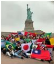
RYE Meets Lady Liberty during optional trip to New York