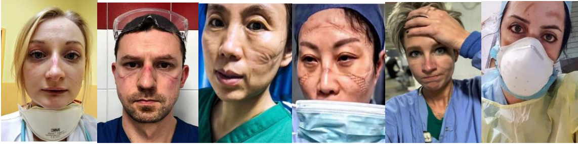
True heroes that are working incredibly hard to take care of all patients not just COVID-19