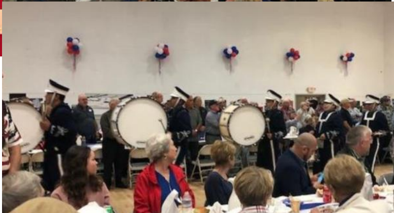
Elsie Allen HS drum corps perform