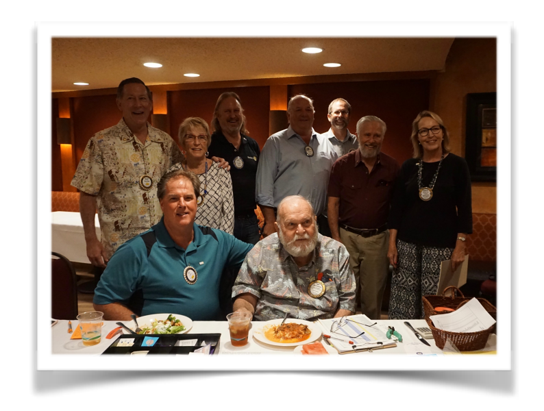
100 Percent Attendance Club

DebS had a wedding anniversary on the road.