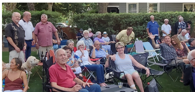
Rotary Row at Concerts in the Park (07/29/21)