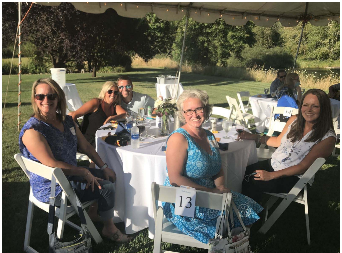
Hello Goodbye Party & Auction