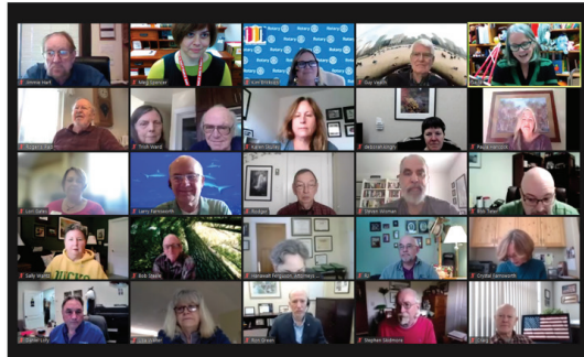
Club Members from February 2