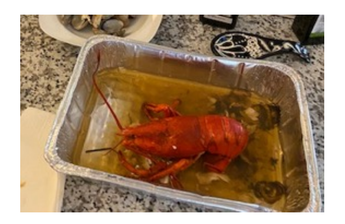
477 Lobsters Procured, Cooked, and delivered.