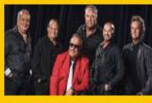
Turnstiles Ultimate Tribute to Music of Billy Joel