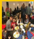
Candlelighters Cancer Support for Children And Their Families

These are Kruse Way Rotary's special charities: