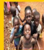
Patrick's Children Feminine Hygiene and Sustainable Farming in Uganda