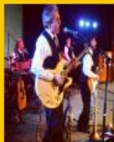
The WannaBeatles Grammy Nominated Performers

Tune in from November 11 to December 2, 2020